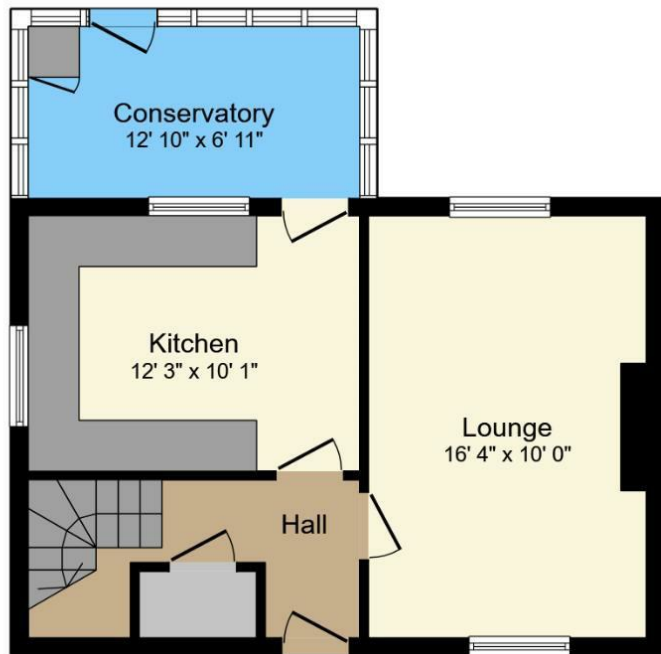
Ground Floor Floor area 484 sq.ft.